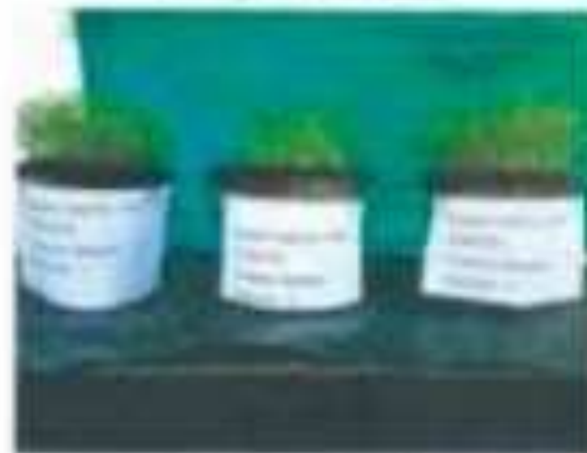
TOMATO GROWTH CONTROL COMPOST