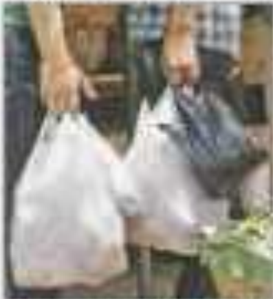
SEEK FAST DISPOSAL OF PLEA

Challenging the government notification. All India