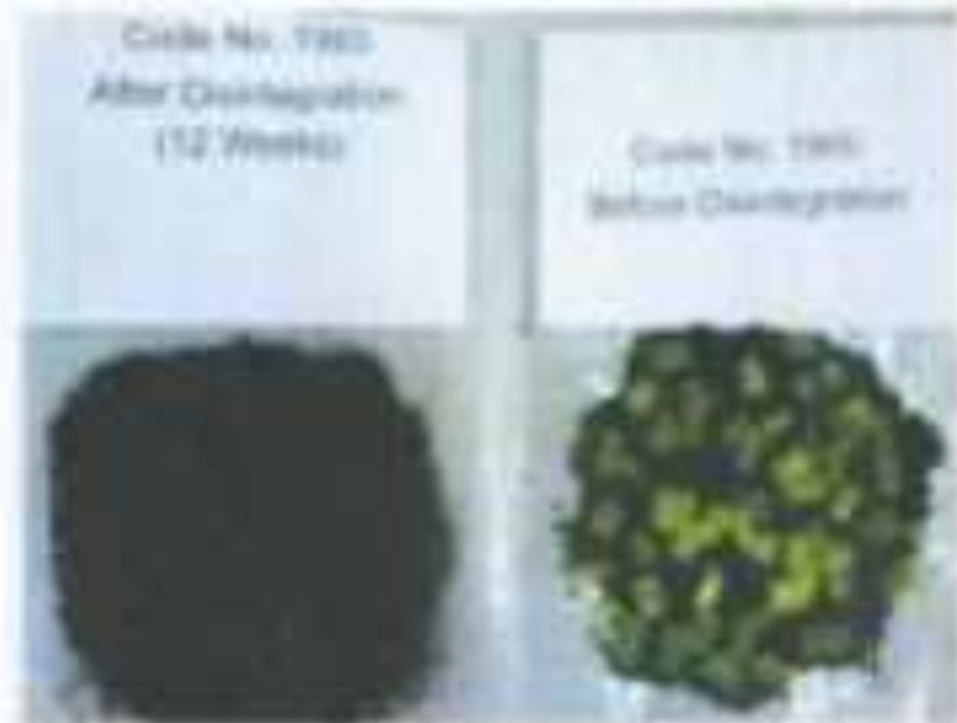
DISINTEGRATION AFTER 12 WEEKS