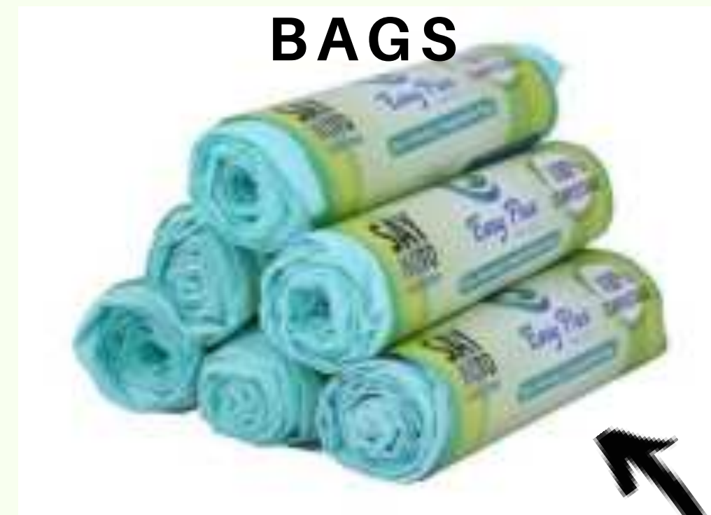
BAG ON ROLL