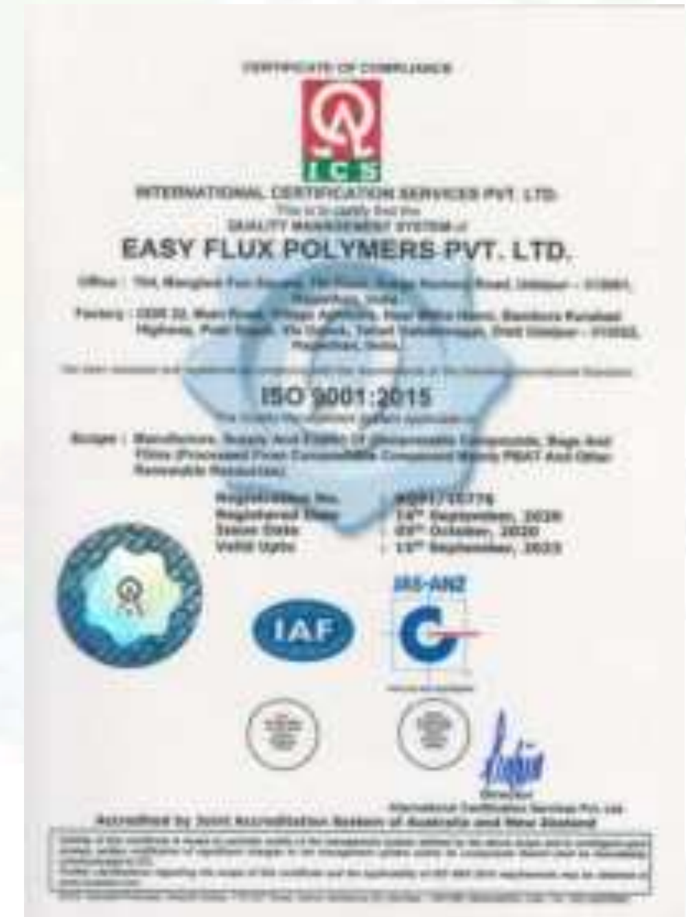
ISO 9001:2015 CERTIFIED