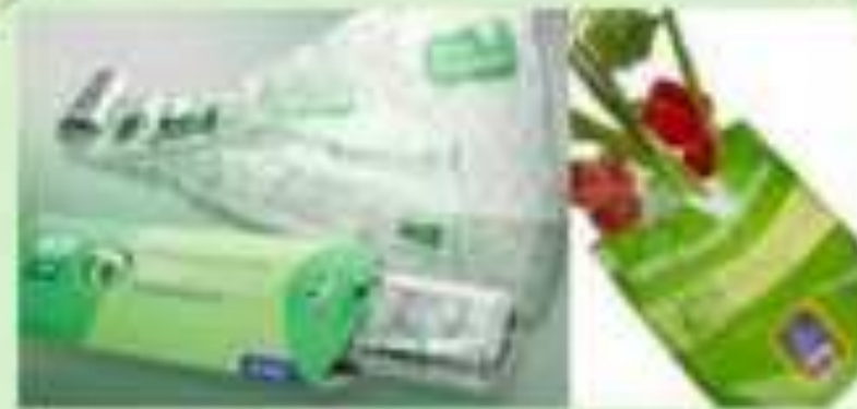
Compostable ecovio® Bags