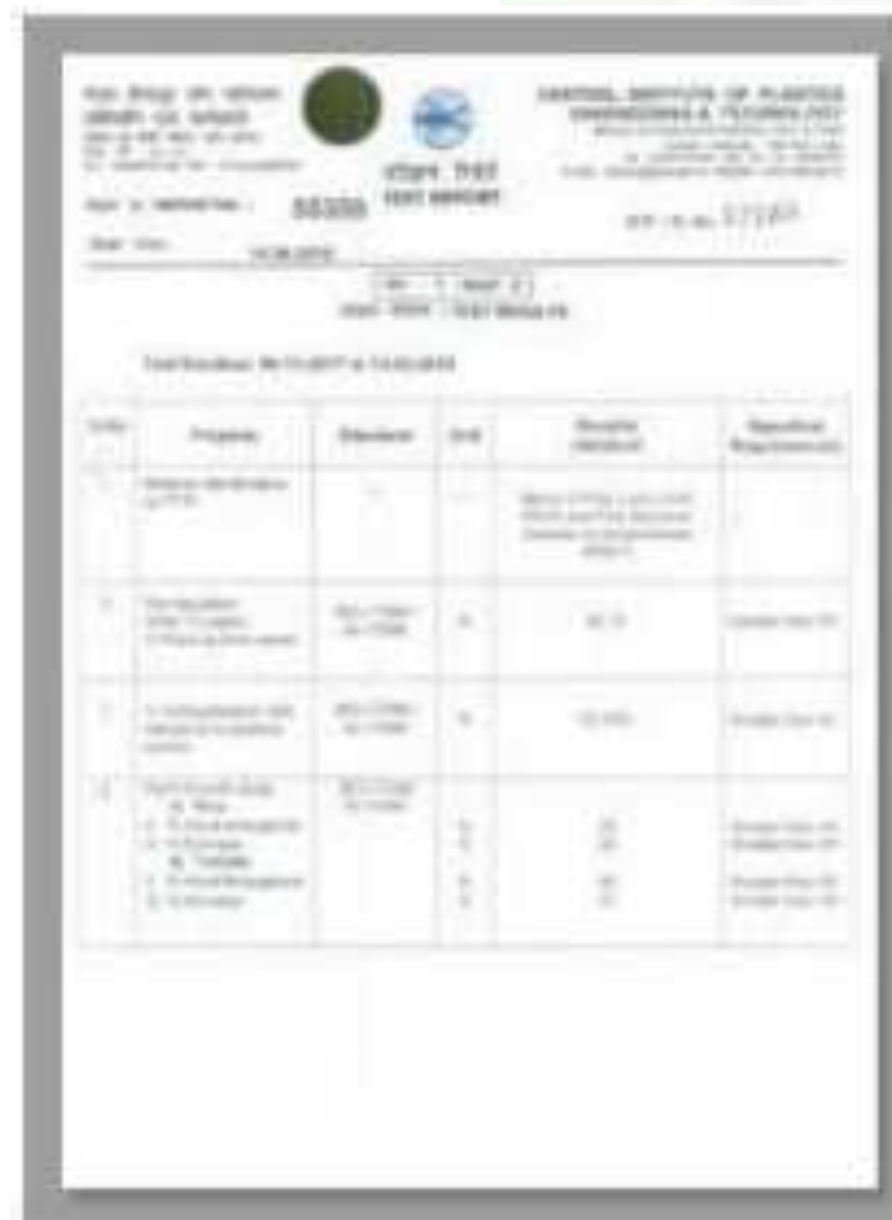
IS/ISO 17088 CERTIFIED